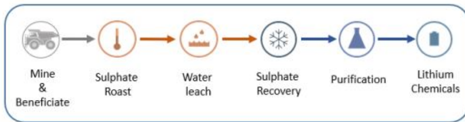
FIGURE 1: SUMMARY PROCESS FLOW SHEET

Potassium sulphate is a key reagent required in the roasting process to extract the lithium product.