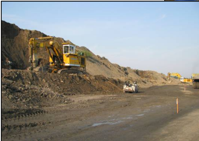
Atlantic Coal's team and equipment building the new railway embankment