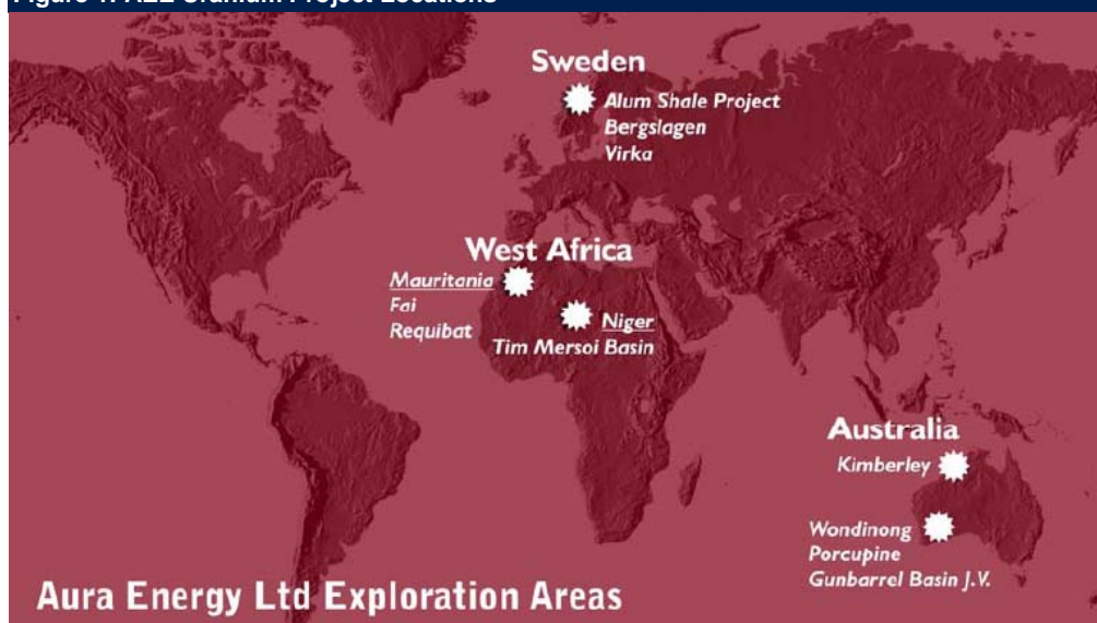
Figure 1: AEE Uranium Project Locations

Tenements in Mauritania provide AEE with additional greenfields uranium targets, while the company's portfolio of advanced projects in Australia offers potential to expand a global resource base.