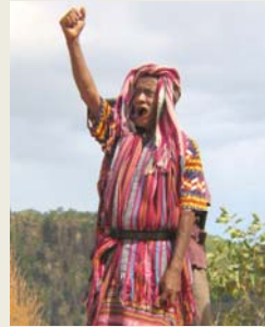
Plus a call to the mountain spirits!